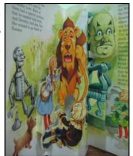
A scene from The Wizard of Oz .