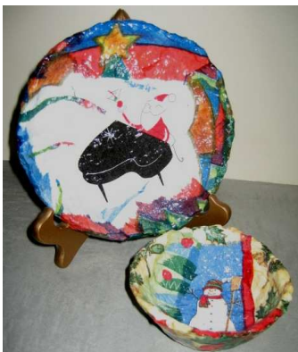
Pieces of art, books, crafts, papermaking kits, etc