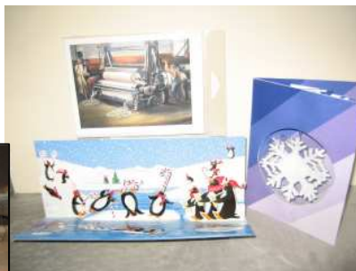
Unique greeting cards