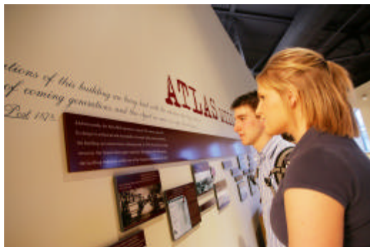
Students take notice of the important role the Atlas Mill played in the history of paper and the Fox River Valley during a recent visit to the Paper Discovery Center.

“Longtime Appleton residents . . . often recall a childhood kitchen or bedroom decorated with the very same wallpapers.”