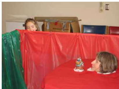
Using mirrors for an optical illusion 'magic trick' during the sight session

In January, the two topics were sight and trees. Both were well attended and lots of fun.